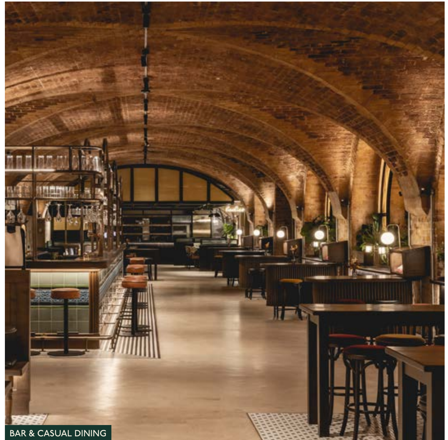
BAR & CASUAL DINING

Under vaulted arches which once guarded the spices, silks and gold that enriched London in years gone by sits an impressive bar worthy of the modern City.