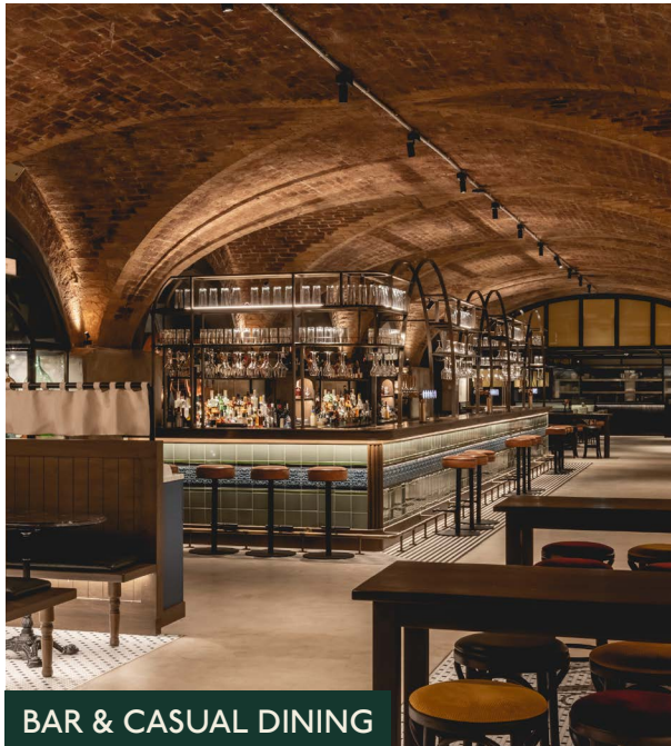
BAR & CASUAL DINING