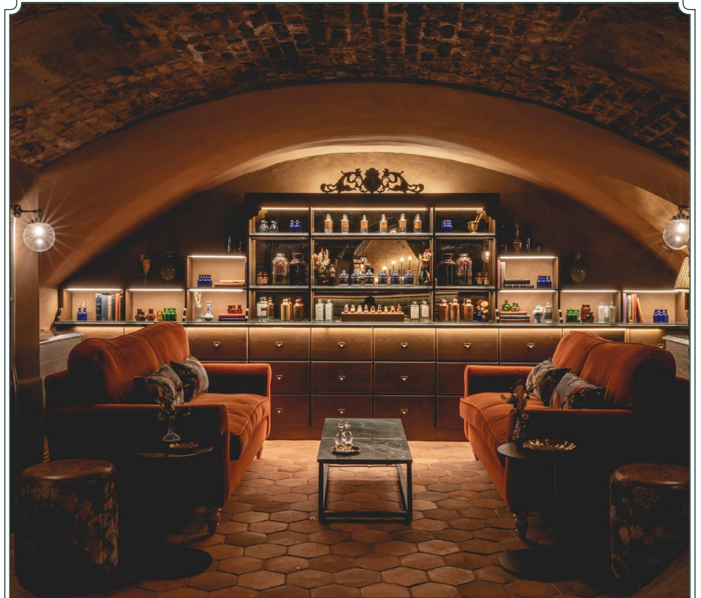
WHISKEY VAULT 10 Seated | 25 Standing