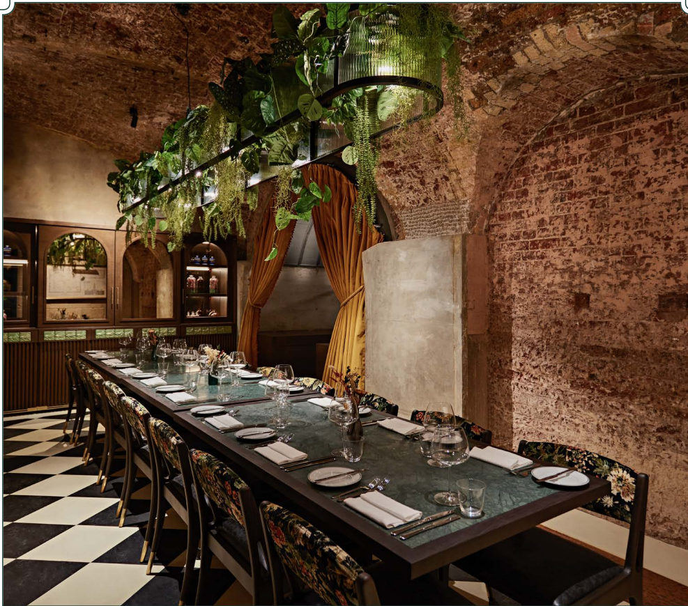
PRIVATE DINING ROOM 20 Seated