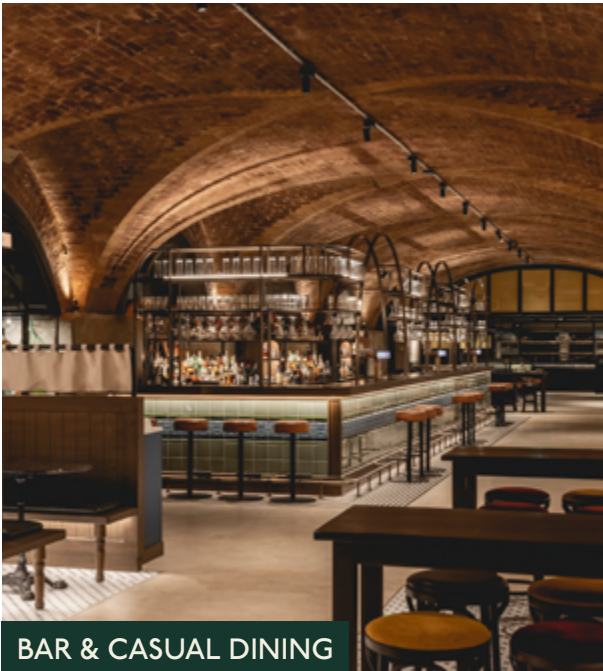
BAR & CASUAL DINING