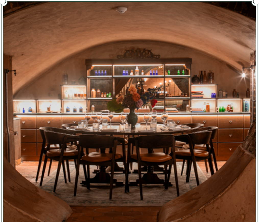
WHISKEY VAULT 10 Seated | 30 Standing